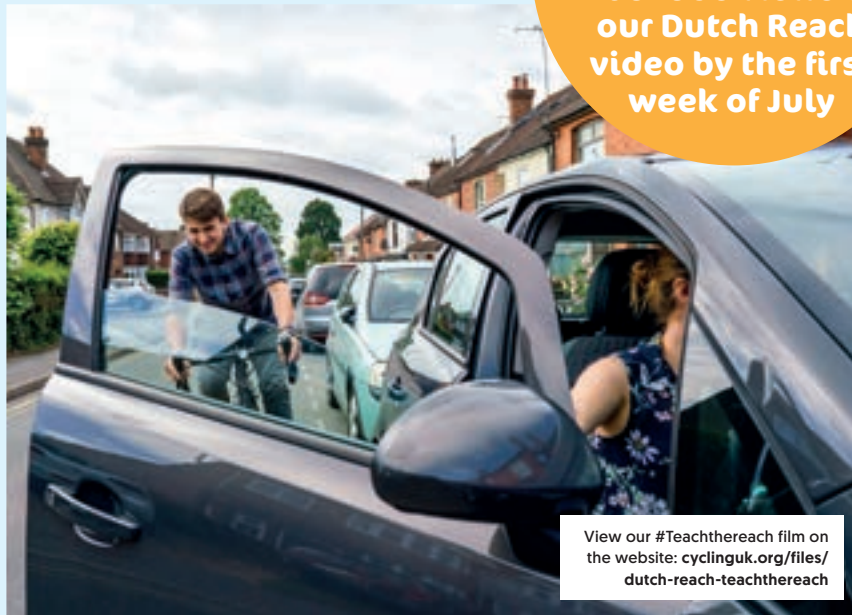
View our #Teachthereach film on the website: cyclinguk.org/files/dutch-reach-teachthereach

YouTube views of our Dutch Reach video by the first week of July