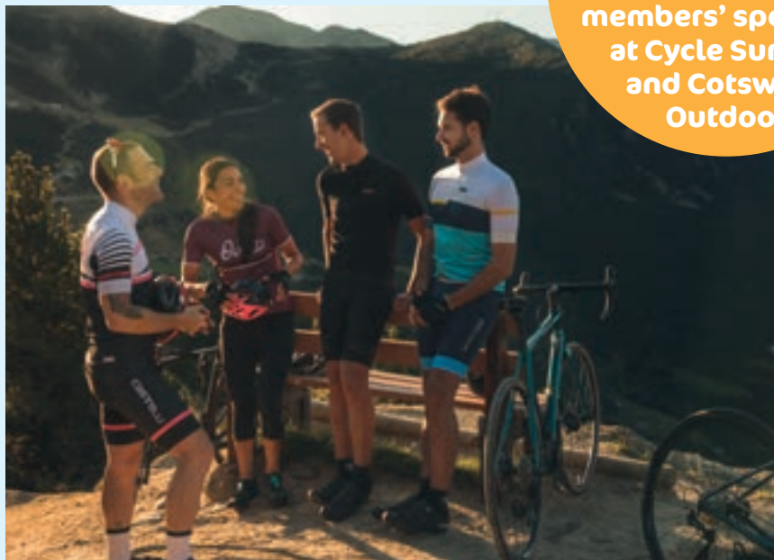
Left & below: Outdoor and Cycle Concepts Ltd