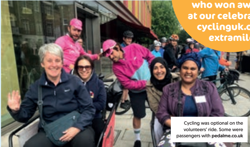
Cycling was optional on the volunteers' ride. Some were passengers with pedalme.co.uk