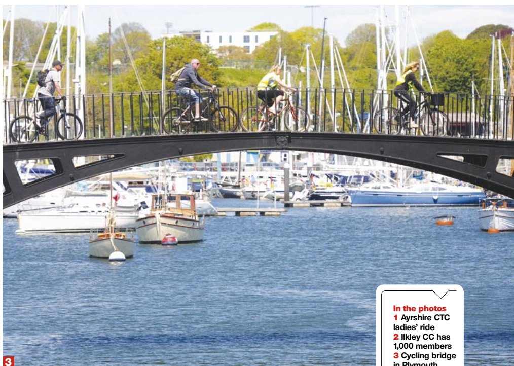
In the photos 1 Ayrshire CTC ladies' ride 2 Ilkley CC has 1,000 members 3 Cycling bridge in Plymouth