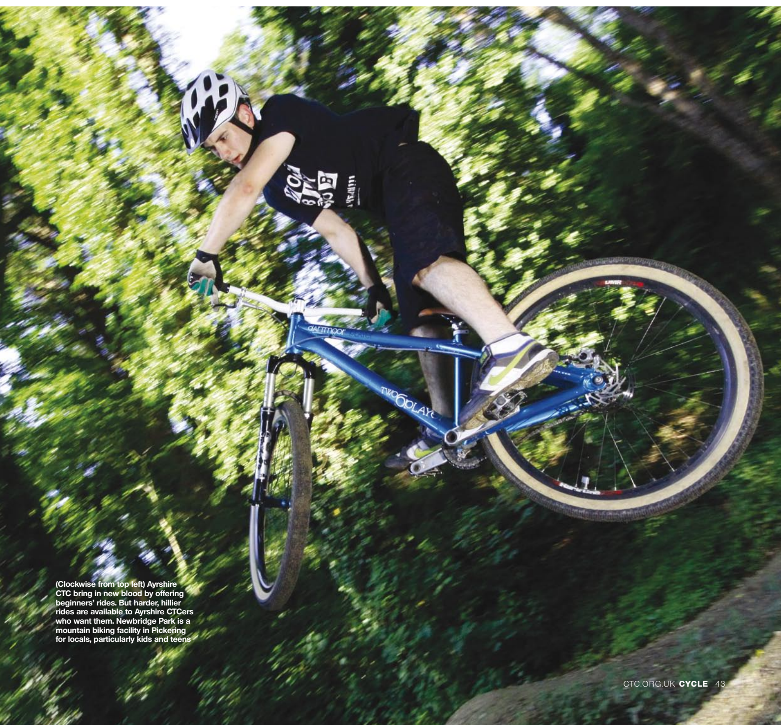
(Clockwise from top left) Ayrshire CTC bring in new blood by offering beginners' rides. But harder, hillier rides are available to Ayrshire CTCers who want them. Newbridge Park is a mountain biking facility in Pickering for locals, particularly kids and teens